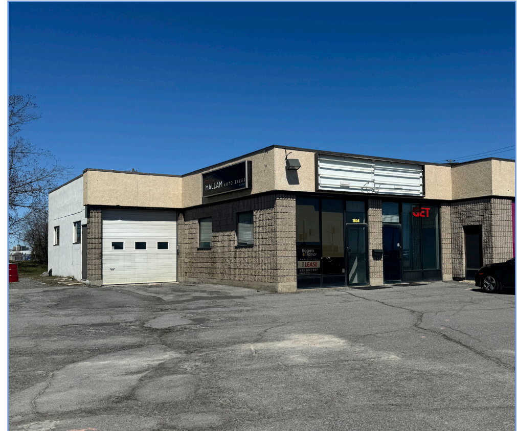
UNIT 2 + 3

UNIT SIZE: +/-2,361 Square feet LEASE RATE: $38.00 Annual Sq Ft Net ADDITIONAL RENT: $11.96 PSF HVAC: Forced Air Natural Gas Furnace with A/C, Supplemental EBB, and Suspended Unit Heater in Garage area